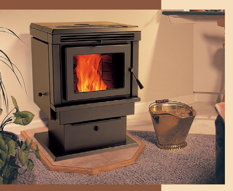
EF2 FS PD