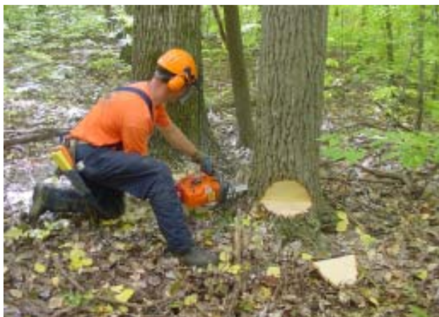
Correct felling techniques, such as those taught through Game of Logging increase productivity and safety while reducing damage to other trees.