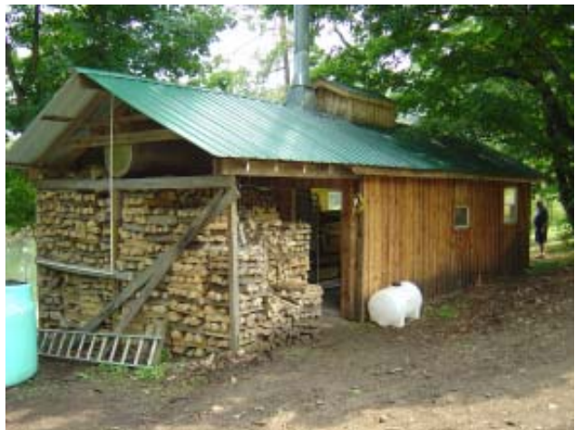
Stack firewood to allow easy access and movement. Stack firewood securely to reduce risk of piles falling.

For household use, an 8-lb. splitting maul or borrowed/rented log splitter are usually more economical than purchasing a log splitter. It will take practice to learn to read the grain, cracks, and knots that make firewood splitting easier. Use a splitting block to stabilize logs you are striking with a maul and wear eye protection, steel-toe boots, and a back brace to prevent strain and injury.