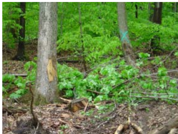
Some trees are designated as “bumper” trees, or trees along skid trails and haul paths that protect other trees. These trees should be retained, otherwise the trees they protect may become damaged during subsequent forest activities. Try to locate corners on skid trails to take advantage of low value trees as future bumper trees.