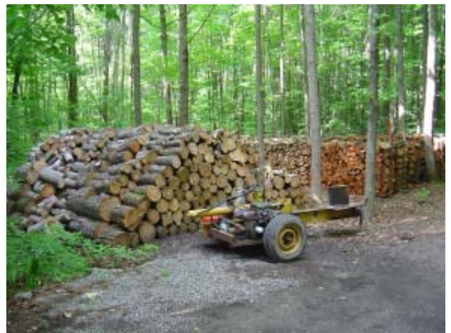
Stacking firewood on the ground can increase the risk of insect and fungal infestation.

Ants, termites, other insects and mice can be a problem if firewood is stored too close to the house, or if infested wood is brought inside. To keep ants, termites, other insects and mice away, firewood should be stored outdoors away from the house and under a shelter or tarp. Keep firewood dry, off the ground, and stacked so air can circulate through the ranks. Avoid storing firewood in the forest where wood-eating insects can infest the logs.