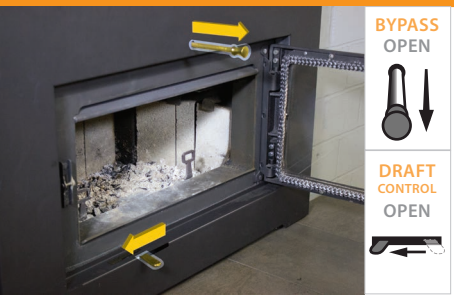
1) Before starting a fire, open the bypass damper , and fully open the draft control.