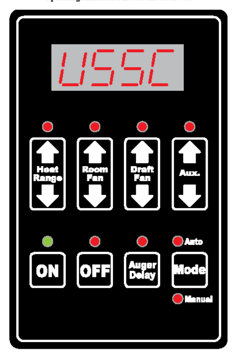
4 Digit 6300 Multifuel Furnace Control Operating Manual Firmware Revision 7.00