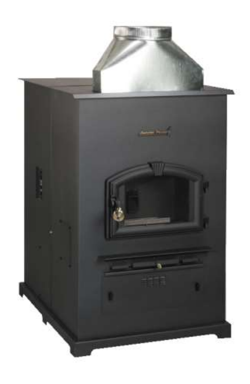
6500 4 Digit Board 3 Heat Ranges