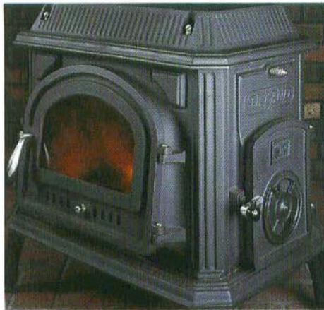
Shown above: Model #107 with optional side door and glass firescreen.