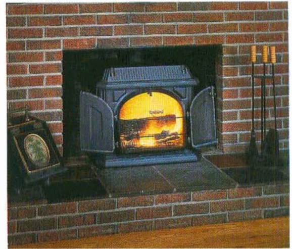
Shown above: Model #107 woodstove as a fireplace insert.