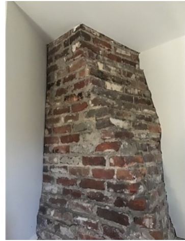
Clearance to combustibles issues