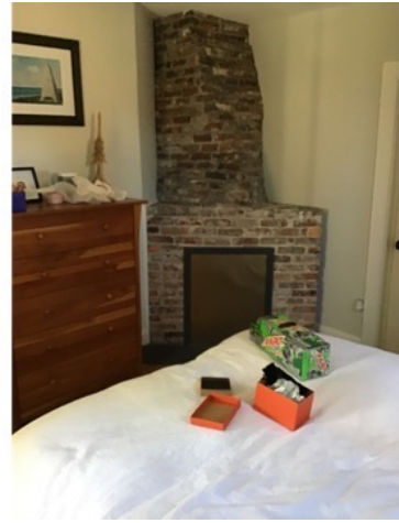
Bedroom fireplace / backside