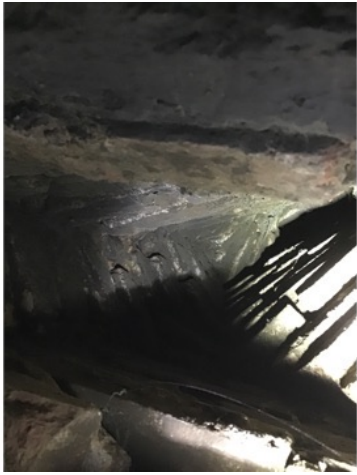
Spiraled smoke chamber , not parged