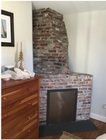
Backside of fireplace