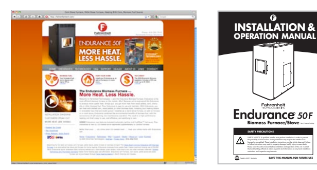
For full clearance and installation information visit www.fahrenheittech.com.