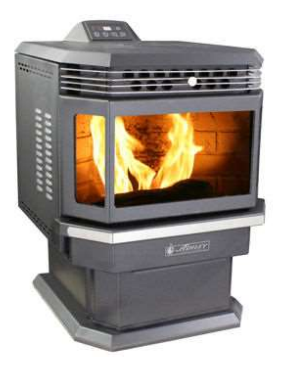
5660 Top Mount Board