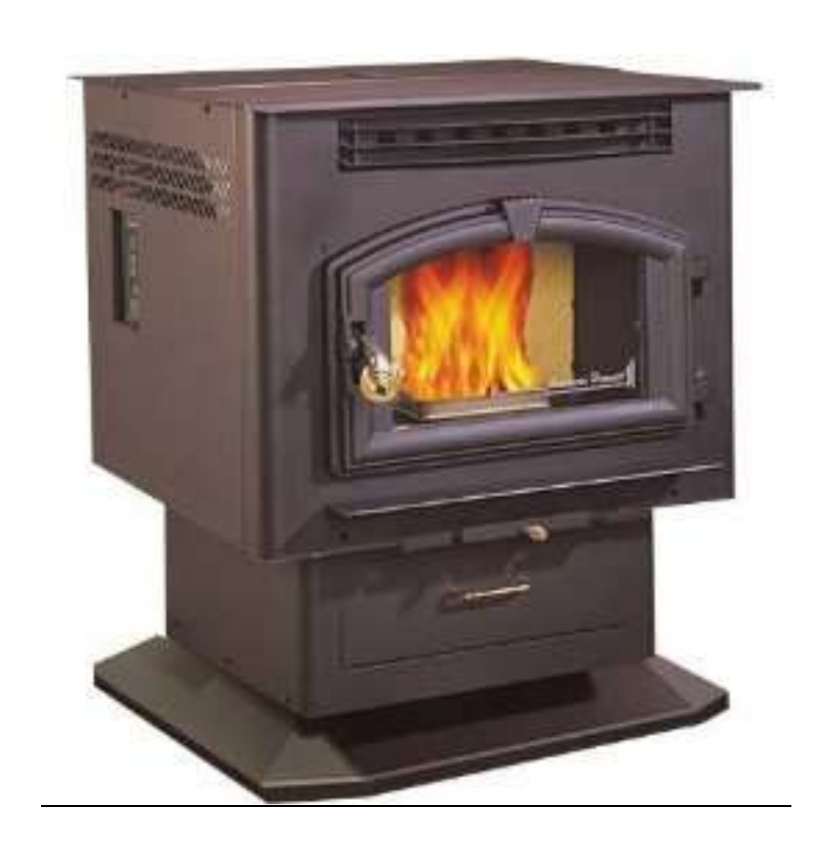
6039 4 digit board