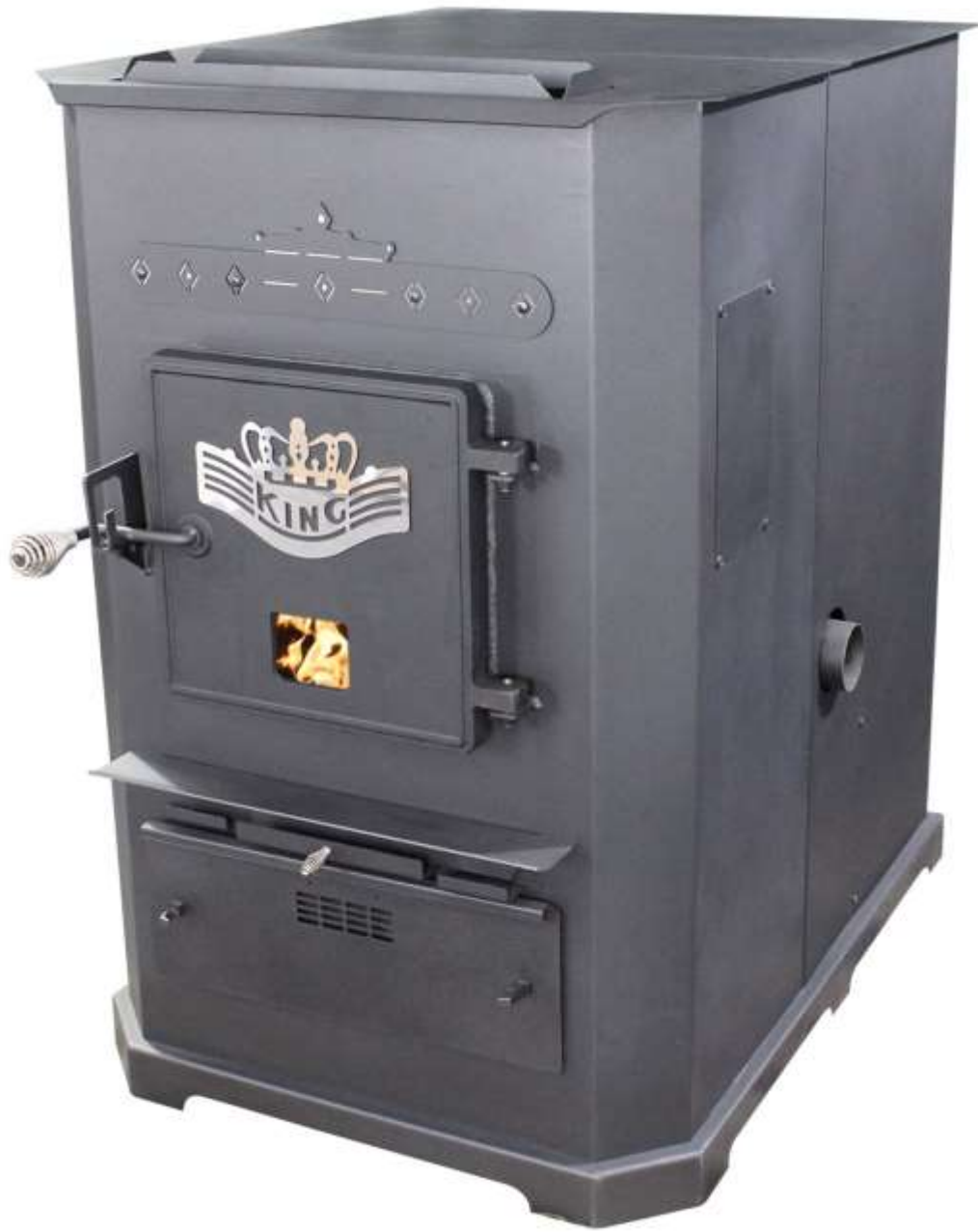
8500 4 Digit Board 5 Heat Settings